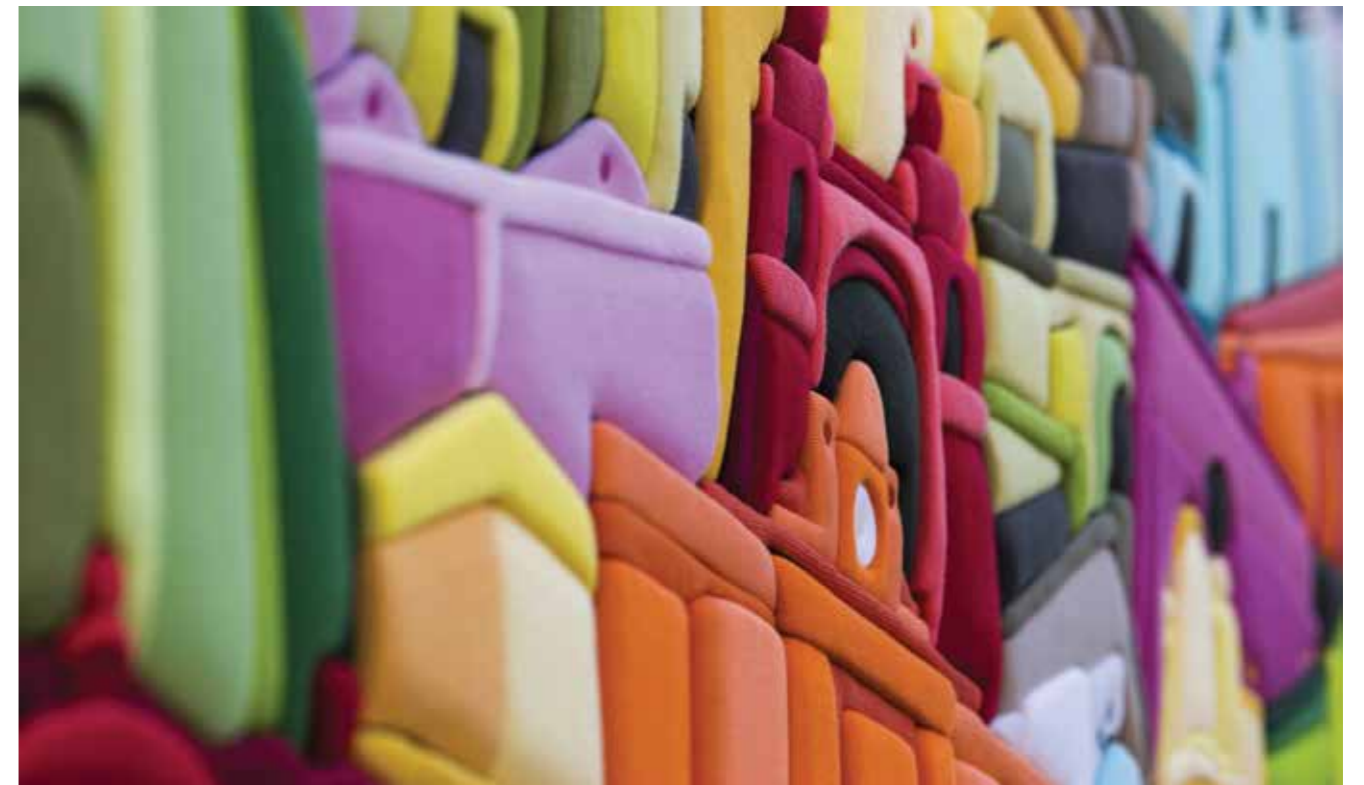
"Matera - Two rocks and the Moon" Detail - 205 x 152 x 8 cm - 2019 - Scultura e stoffa di abbigliamento

irreverence or presumption - to have my say as the creator of a unique technique that can live up to the comparison - obviously, with all due respect. It can also entertain viewers and challenge them to face the fact that it cannot be seen as just one movement or current - a game that, as they will find, they need to experience within themselves first, in the attempt to overcome their limits once again, without ending up being trivial, leveraging on valuable contents and thoughts, which I consider at the basis of any artistic motivation or vision." The remake of Depero's design will be previewed at the Hotel Splendid Royal in Lugano at the evening presentation of Excellence Fine Art, alongside the picture that Giovanni Gastel will take of Bressani wearing his work. The whole backstage of the sculpting process and photo shooting at the Gastel studio will be told in a reportage by Loredana Celano, on view at the Expowall gallery in Milan.