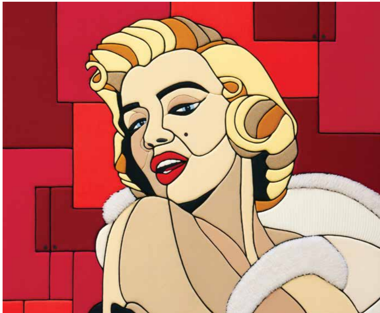
Marilyn 100x100x4 cm - 2008 - Scultura e stoffa di abbigliamento

Non so dire oggi se per caso o per fortuna, ma la considerazione sul movimento rappresentato, il Futurismo appunto, mi ha spinto ancora una volta, lontano dalle irrivenze artistiche e dalle presunzioni,