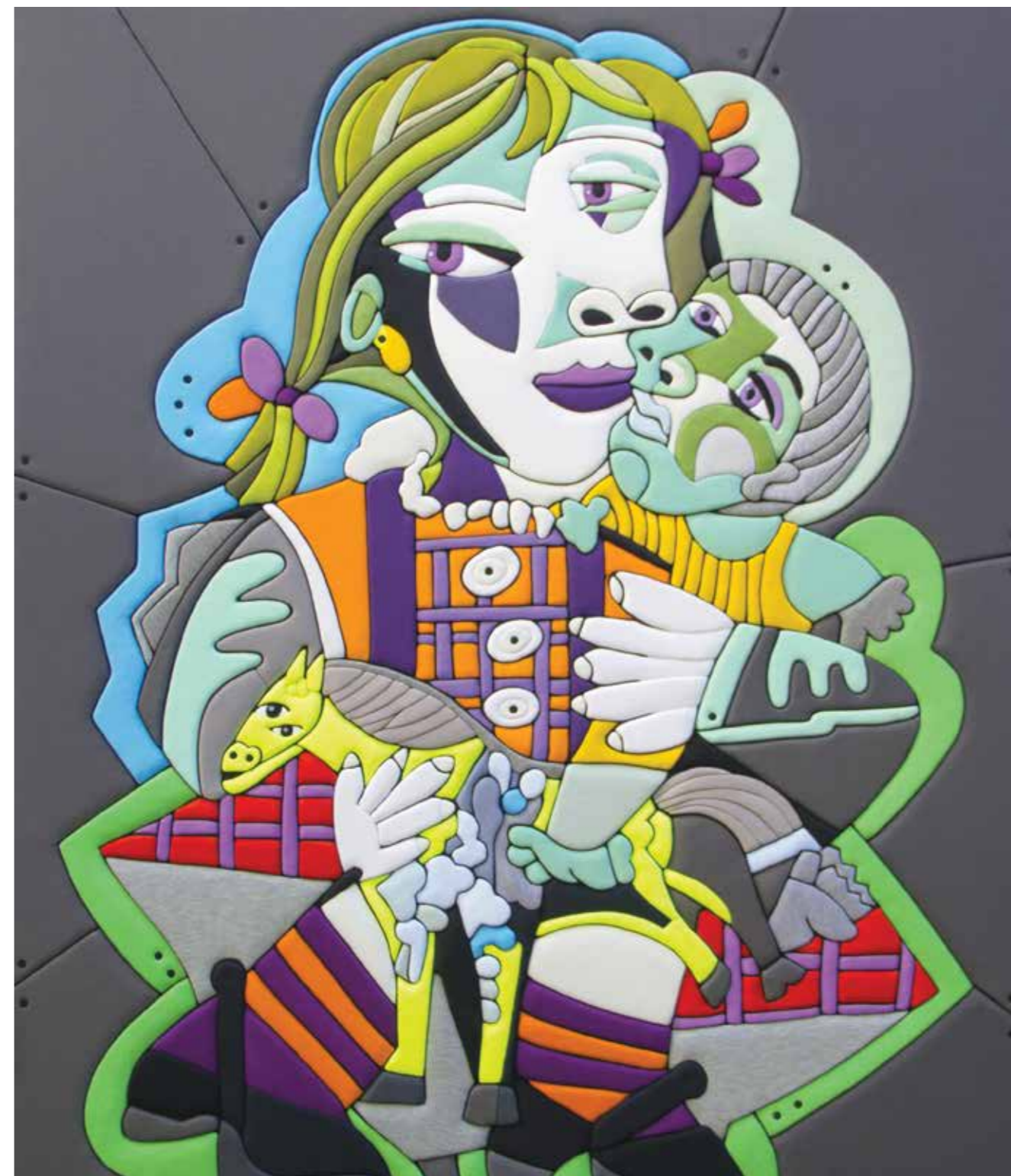
Maya con bambola 150 x 120 x 6 cm - 2014 - Scultura e stoffa di abbigliamento (particolare)

portraits realized by the great names of photography among which Nino Migliori, Giovanni Gastel, Maurizio Galimberti, Graziano Perotti, Douglas Kirkland. Due to Covid-19, the exhibition planned at the Priamàr monumental complex, the fortress symbol of Savona, is postponed to 2021.